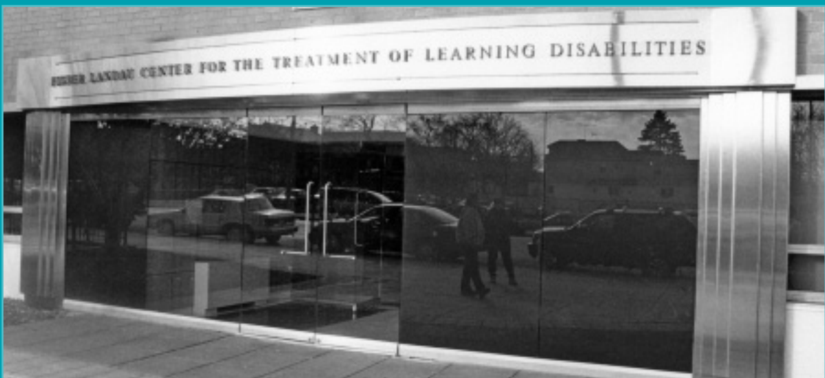
FISHER LANDAU CENTER FOR THE TREATMENT OF LEARNING DISABILITIES ALBERT EINSTEIN COLLEGE OF MEDICINE OF YESHIVA UNIVERSITY